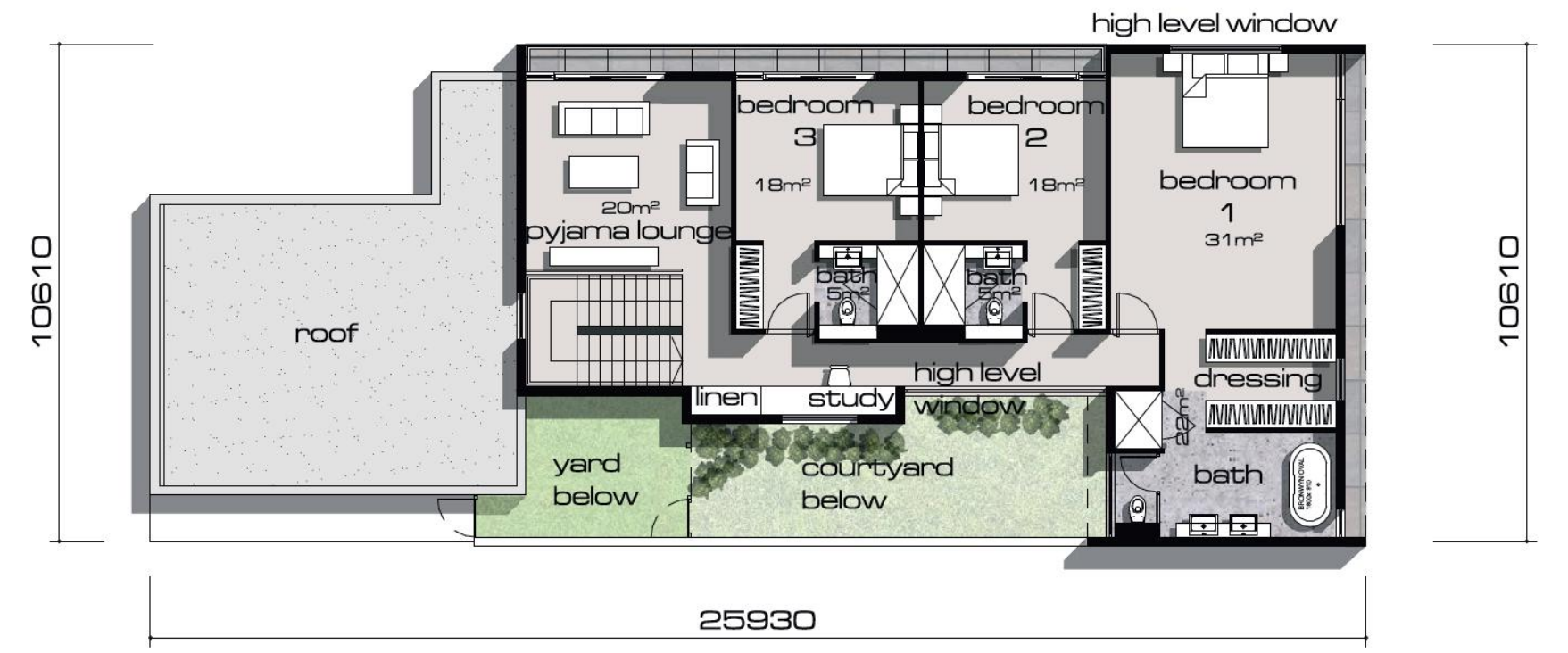
first floor plan